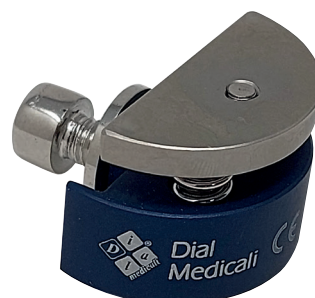
dyna-clamp to allow the dynamization of the callus